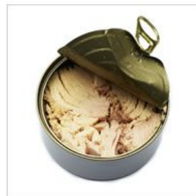
fish (fresh, smoked or canned)