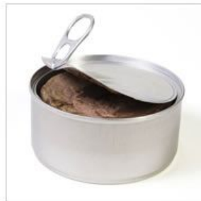
wet cat food