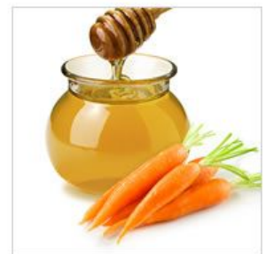
vegetables coated in honey or sugar